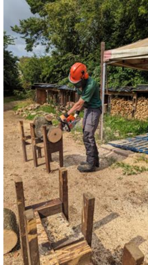
Foxy's Woodland Shop Seasoned Firewood